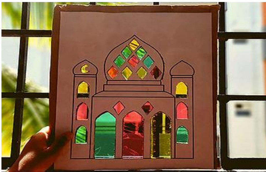
MOSQUE SUNCATCHER CRAFT

Promoting cultural awareness from an early age is important. As socially conscious parents, we want to ensure our children grow nourished with wider perspectives of the world that we live in.